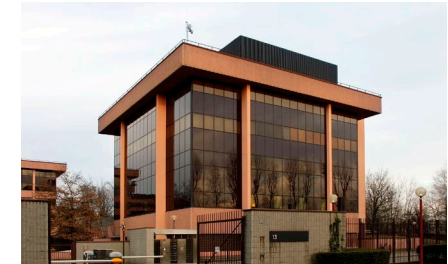
Equinix Milan IBX data center*