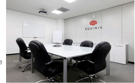
Equinix Milan IBX data center