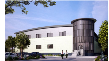
Equinix Manchester IBX data center